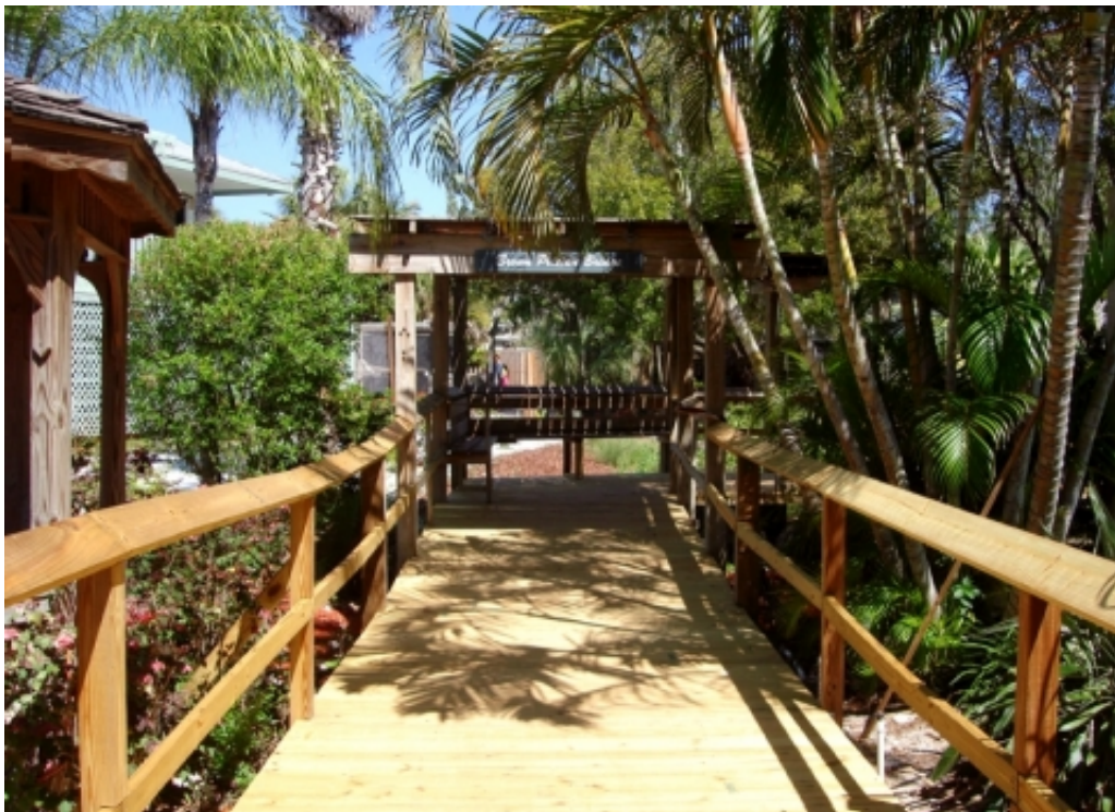
ABOVE - A NEW BOARDWALK BUILT BY LEADERSHIP SARASOTA, CLASS OF 2011 FOR A LOCAL NON- PROFIT.