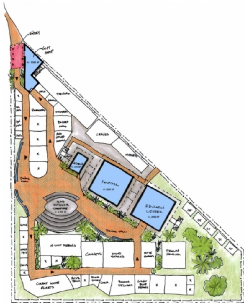
ABOVE - SCHEMATIC MASTER PLAN FOR A NON - PROFIT LOCAL CENTER.