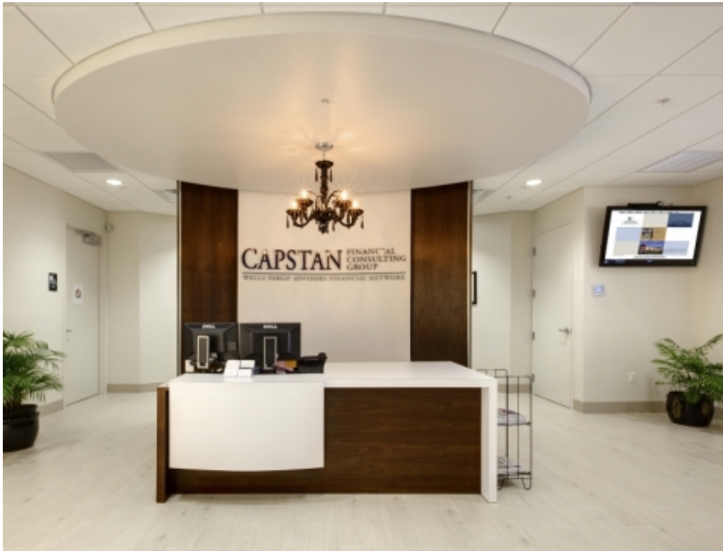
ABOVE: ENTRY SIGN FOR A FINANCIAL INSTITUTION BY THE SCHIMBERG GROUP