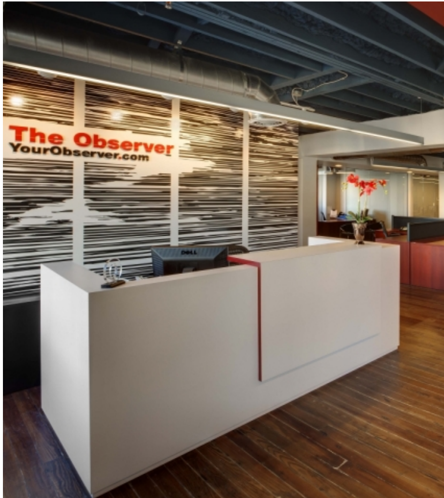
ABOVE : ENTRY SIGN FOR MEDIA GROUP DESIGNED AND INSTALLED BY THE SCHIMBERG GROUP