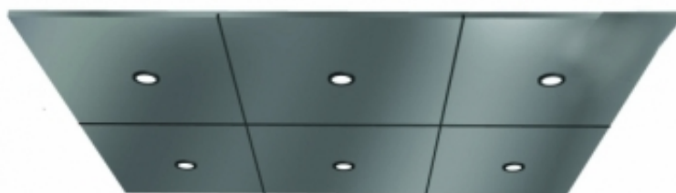
ABOVE - ELEVATOR CEILING OPTIONS