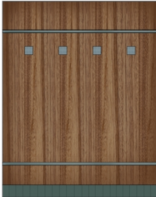
ABOVE- RENDERING OF AN ELEVATOR RENOVATION BY THE SCHIMBERG GROUP.